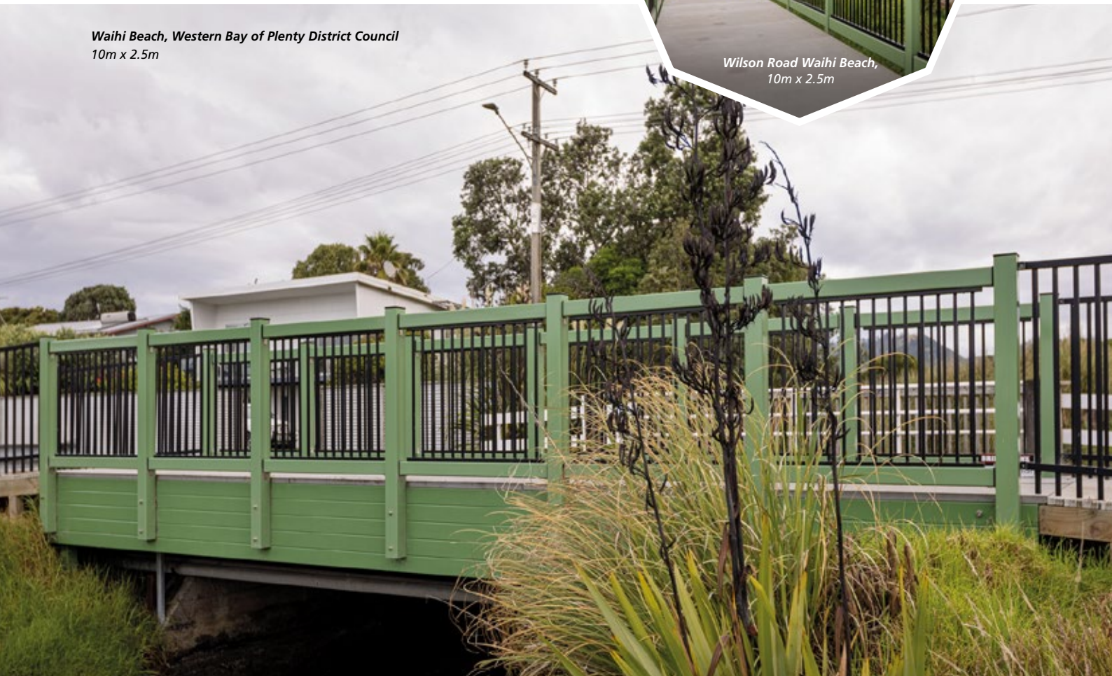
Waihi Beach, Western Bay of Plenty District Council 10m x 2.5m